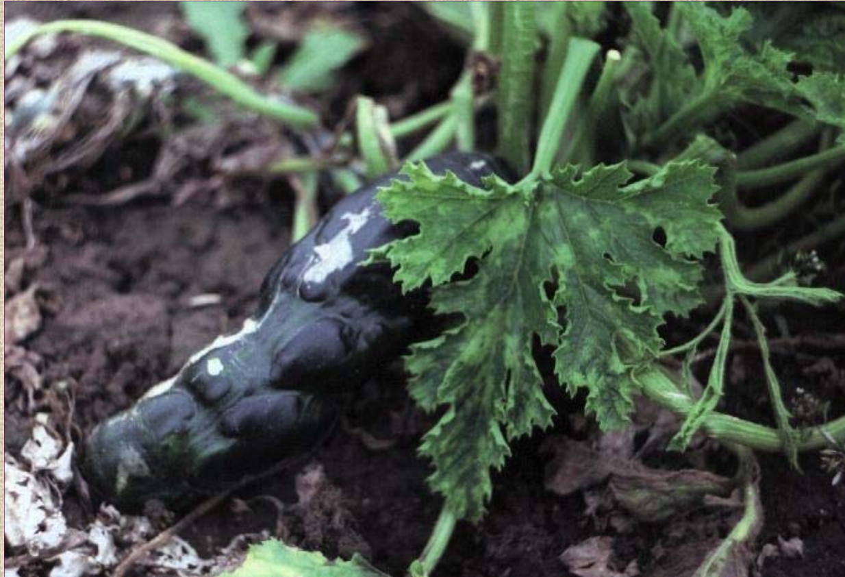
Fig. 3. Malformed fruit of summer squash cv. 'Zelená', plant naturally infected with ZYMV.

Bt-sweet corn was accepted in the fresh market in the United States, transgenic Bt-eggplant was bred to reduce pesticide use in Asia. In South Africa transgenic Bt-potato resistant to potato tuber moth (PTM), Phthorimaea operculella was developed and field trials were conducted between 2001 and 2007. Bt-potato provided excellent control of PTM. Biotech potato cultivars resistant to Potato virus Y , and Potato leafroll virus are developed.