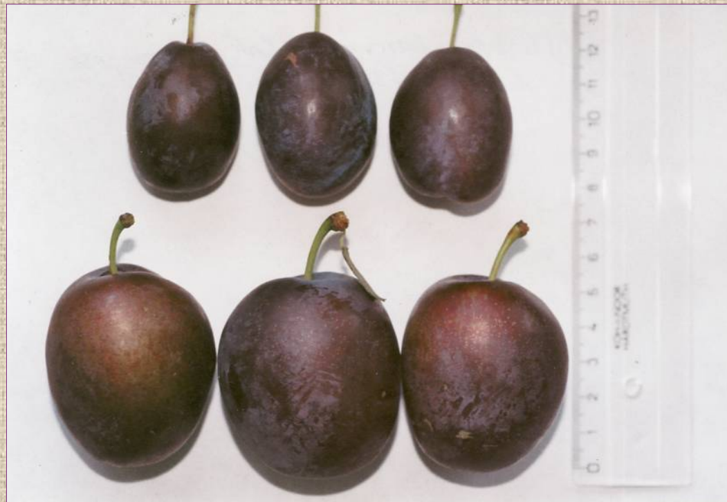
Fig. 6. Fruits of plum cv. 'HoneySweet' - bottom row, fruits of plum cv. 'Jojo' - upper row.

'HoneySweet' plum has been evaluated for eleven years (2002-2012) in a regulated field trial in the Czech Republic for resistance to PPV, Prune dwarf virus (PDV), and Apple chlorotic leaf spot virus (ACLSV), all serious diseases of plum. Even under high and permanent infection pressure produced through grafting, PPV has only been detected in 'HoneySweet' trees in several leaves and fruits situated close to the point of inoculum grafting. The lack of infection spread in 'HoneySweet' demonstrates its high level of PPV resistance. Coinfections of PPV with PDV and/or ACLSV had practically no influence on the quantity and quality of 'HoneySweet' fruit which are large (Fig. 6), sweet, and of high eating quality. In many respects they are superior to fruit of the well-known cultivar 'Stanley'.