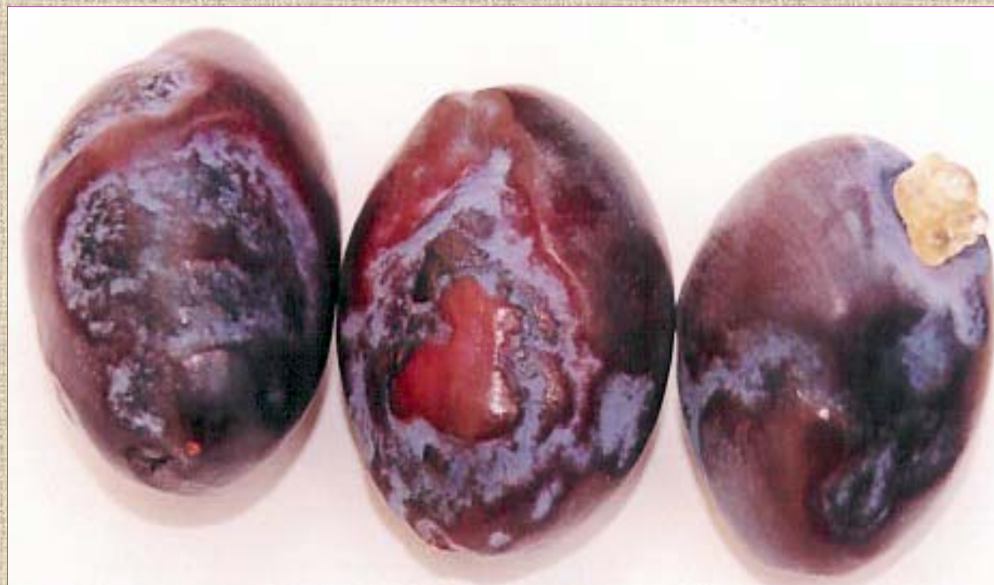
Fig. 4. PPV symptoms on plum fruits cv. Domáci švestka.

Plum pox virus is causal agent of economically most important disease of stone fruits (Fig. 4). Plum ( Prunus domestica L), clone C5 transformed with the Plum pox virus (PPV) coat protein (CP) was obtained by Scorza et al. (1994). Clone C5 (cv. 'HoneySweet' at present) was proved to be highly resistant to PPV under glasshouse conditions (Ravelonandro et al., 1997). Field tests were conducted in Poland (Malinowski et al., 1998), Romania (Ravelonandro et al., 2002; Zagrai et al., 2008), Czech Republic (Polák et al., 2005), and in Spain (Malinowski et al., 2006). The all experiments confirmed the resistance of clone C5 to PPV infection.