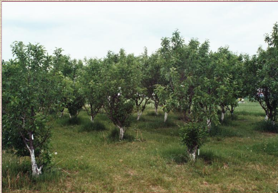
Fig. 5. Plantation of 'HoneySweet' trees in CR in 2011

A trial (Fig. 5) of high and permanent infection pressure of PPV-Rec alone and in combinations with Prune dwarf virus (PDV), and Apple chlorotic leafspot virus (ACLSV) was initiated in the Czech Republic and partial results were published (Polák et al., 2008a; 2008b).